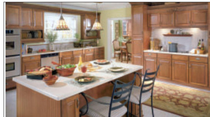
Create your own personal living space at a price you'll like; stock cabinet manufacturer, Shenandoah Cabinetry, continues to offer more design possibilities with the expansion of its Orchard Collection.

■ Adjustable, full-depth shelves with metal shelf rests on wall cabinets give extra stability for heavy items.