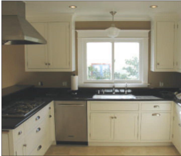
Glossy, carefree granite countertops are hot in the real estate market because of their good looks and sensibility. They are bacteria, scratch and burn resistant. Now, they can be installed in a home with in less time and with less cost with the GraniteWorx system.

The Navarre Beach Fall Festival of the Arts is planned for October 10, 11 and 12, 2008, with two days of Artist and Fine Crafters booths. Up to 80 artists booths are available, many already reserved by participants from the past two years because they had such successful shows. Local artists and crafters are encouraged to see the Greater Navarre Beach Arts Assoc. website, www.gnbba.org for festival information and application forms. For more information contact Connie Jones at (850) 939-7964.