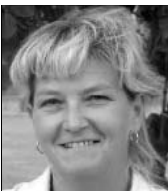
"I am not necessarily afraid of driving over the bridge. But I may invest in the safety tool that breaks auto glass -- for peace of mind!"