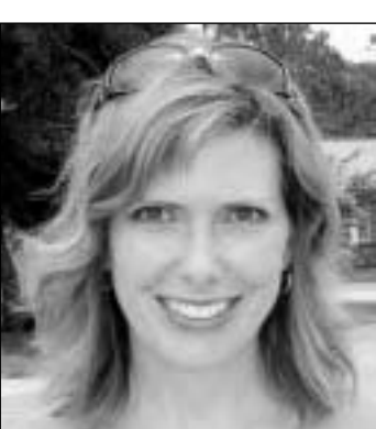
"I feel pretty safe about our bridges. I know safety is involved... I'm pretty confident in the construction of our bridges. [Public Safety officials] are not going to let you pass when the weather's unsafe.."