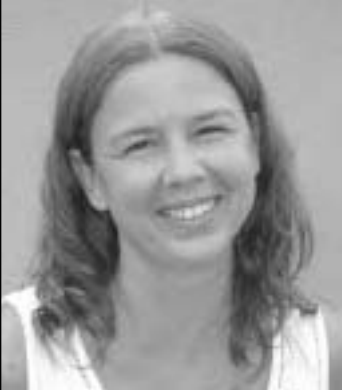
"Yes, because our bridges are more of a concrete structure, unlike the one that collapsed (in Minneapolis)."

I treasure my young foreign friends from all over the world. After years, some still keep in contact and many return a second and third time. I just wanted you to know there are some of us out here that do it right.