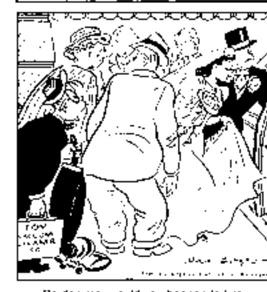
Pardon me, would you happen to know where they plan to 'ave'?