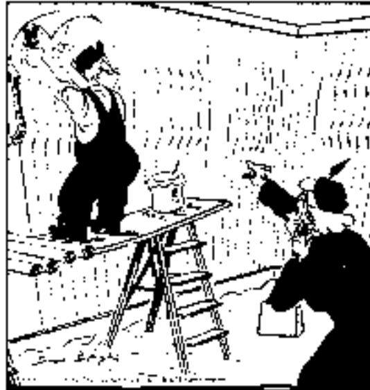
"Madam, do I try to manage YOUR affairs?"