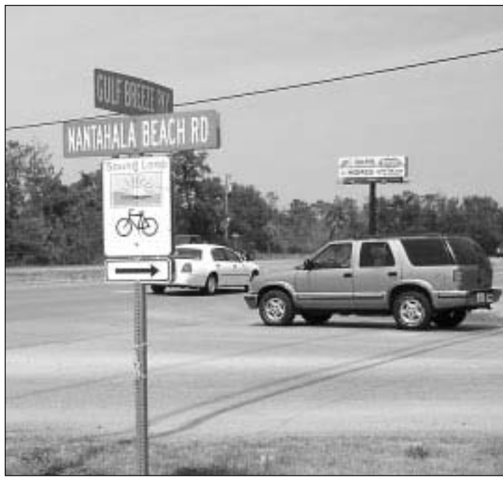
The intersection of Nantahala Beach Road and U.S. 98 is one of several road crossings that should receive additional turn lanes by the end of 2007.

In the spring, the BOCC received a letter from the Florida Department of Transportation (FDOT), regarding an FDOT traffic study, claiming that there were insufficient traffic levels on